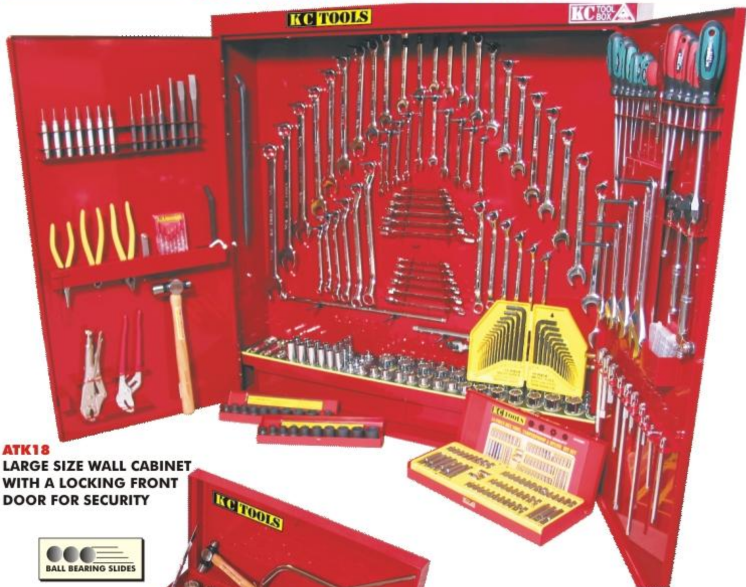
ATK18 LARGE SIZE WALL CABINET WITH A LOCKING FRONT DOOR FOR SECURITY