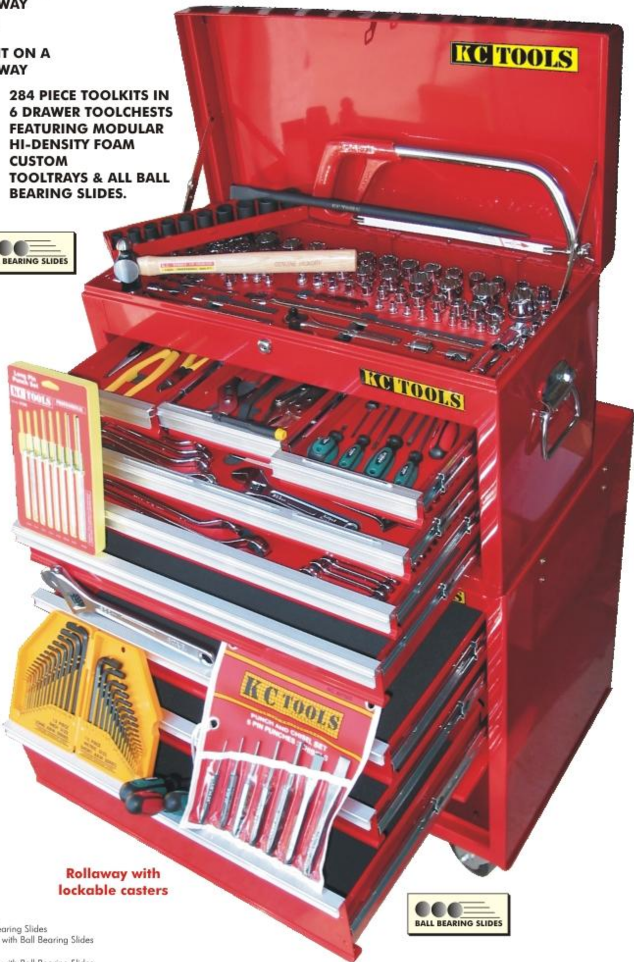
Rollaway with lockable casters