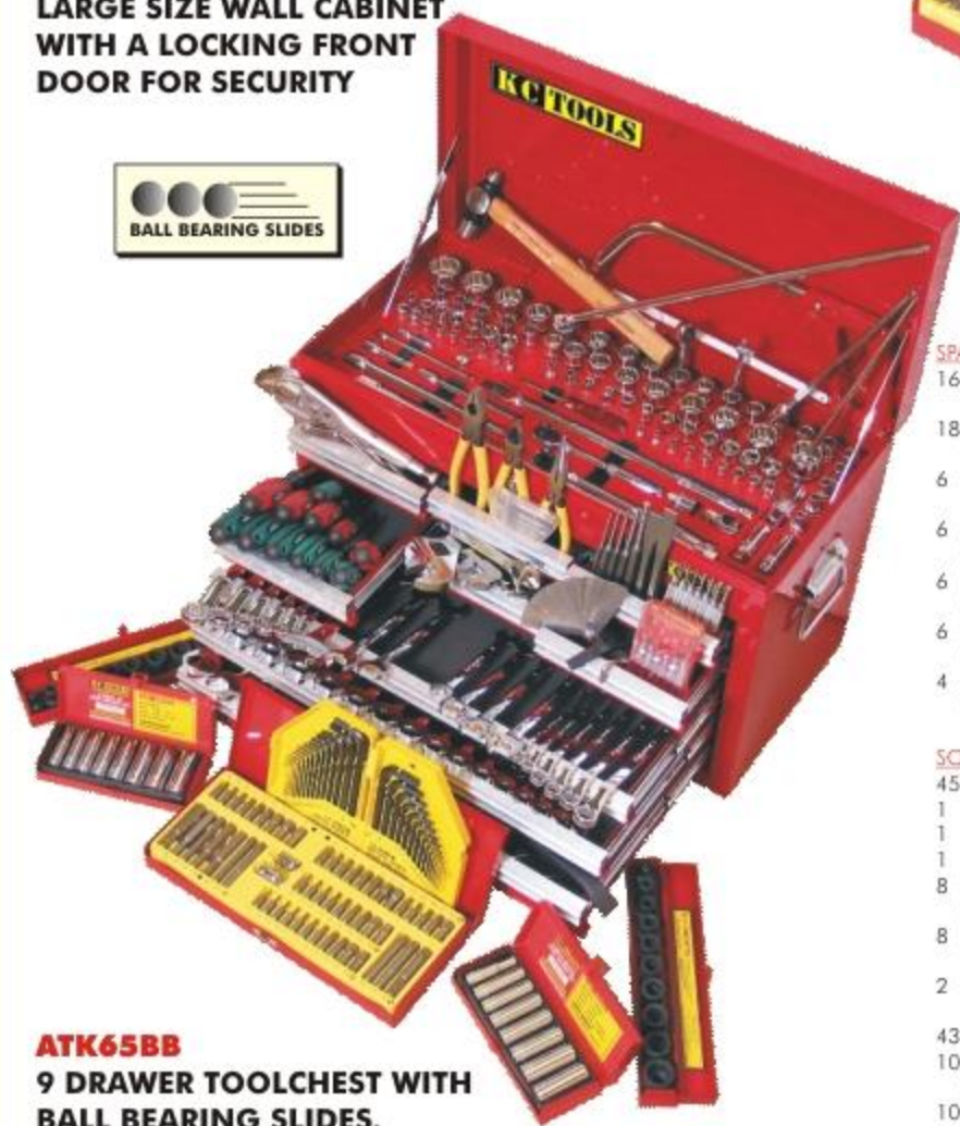
ATK65BB 9 DRAWER TOOLCHEST WITH BALL BEARING SLIDES.