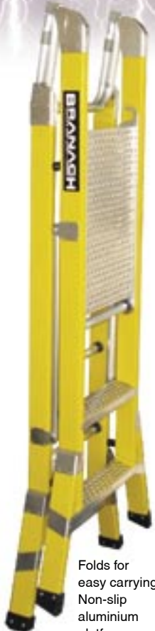
Folds for easy carrying. Non-slip aluminium platform and steps. Non-scurf feet