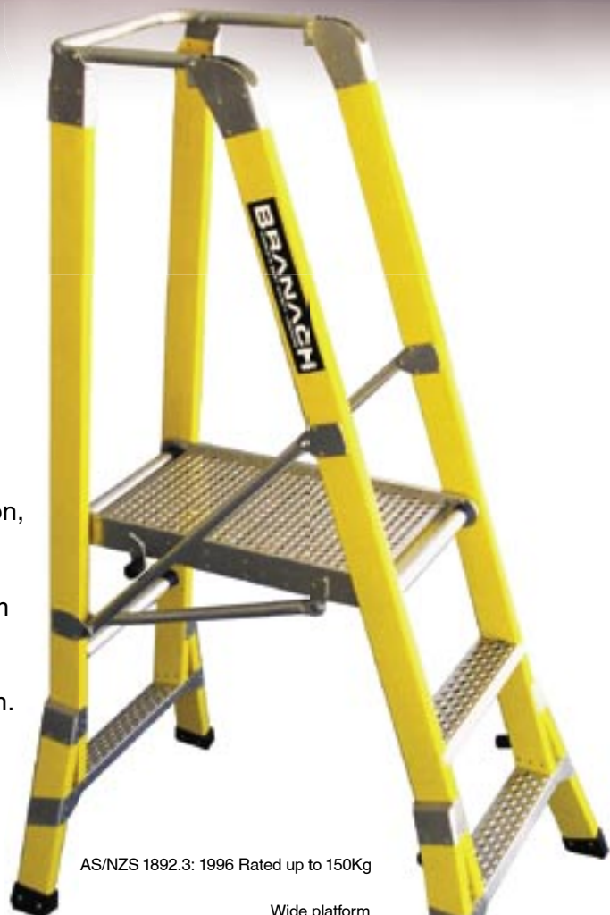
AS/NZS 1892.3: 1996 Rated up to 150Kg